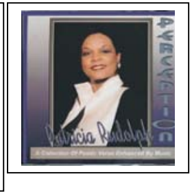
Perception - Patricia Rudolph CD Price: $12.99

ITEMS: (Return Check Policy: A fee of $25 for NSF on payment of order) (charge orders ship in 24-48 hours / check orders ship in 1 week)