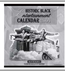
Black Historical Entertainment Price: $12.99